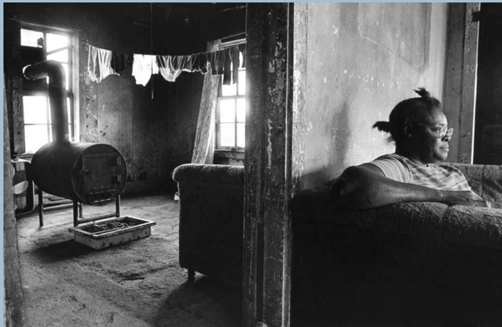
Home, bitter home? Tradition holds that home is a haven, where people are protected and nurtured. For many, however, home is a health hazard when factors such as poverty, environmental contamination, and poor design combine to cause or exacerbate disease.

The first study showed that, of 82 neighborhoods studied in four northern/central California cities, the most deprived neighborhoods contained more places that sold alcohol than the least deprived neighborhoods, despite the fact that residents of the higher-SES neighborhoods were the most likely to be heavy drinkers. Winkleby cites this disproportionate clustering in low-income neighborhoods—with its documented sequelae of greater injuries and violence due to increased rates of youth drinking and driving, assault, and car crashes—as one