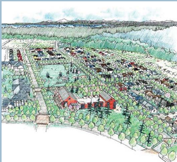
Making houses into healthy homes. The High Point Healthy Homes and Community Project in Seattle is employing a new paradigm for public housing: design with health and sustainability in mind.

This project of the local public health department, housing authority, social service providers, public housing residents, and the University of Washington, with funding from the NIEHS and HUD, is paying particular attention to the needs of families affected by asthma.