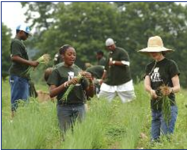
YOUTH LEARN AND PRACTICE SUSTAINABLE AGRICULTURE

the city of Boston's generosity. The city leases urban farm plots to TFP for minimal costs. Additionally, in 2007, TFP built 75 raised-bed gardens in areas like Dorchester and supplied them with organic compost in order to further inspire and support others in the Boston area to grow fruits and vegetables.