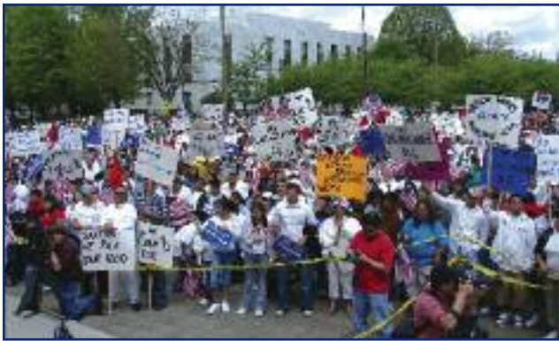
THE LABOR UNION HAS NEVER BACKED DOWN FROM ISSUES THAT NEGATIVELY IMPACT IMMIGRANTS AND THEIR FAMILIES

from conventional to organic farming when feasible and safer. PCUN has also developed a union label process which certifies corn and strawberries as union-grown products that are cultivated with little or no pesticides. Through relationships with local churches, markets, and Willamette University, farmworkers have helped distribute and market union label produce because it is grown under humane working conditions. Not only does union certification represent a seal of approval for workers rights, but it has also increased local access to fresh fruits and vegetables. Just last year, PCUN sold 6 tons of organic produce grown by small and organic farmers to mom and pop shops in Latino communities that would not otherwise have carried such produce. “It just would not have happened without PCUN’s push for these local markets to carry the union label vegetables,” according to Ramirez. Soon, PCUN’s market will expand to Lewis and Clark University.