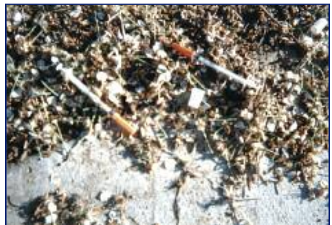
HYPODERMIC NEEDLES WERE ONE OF MANY BARRIERS THAT DISCOURAGED PARENTS AND FAMILIES FROM USING THE PARK

Now groups throughout the county and the region are calling on the parents in the Greenfield Walking Group to get their input and feedback. For example, as the Kern Council of Governments works