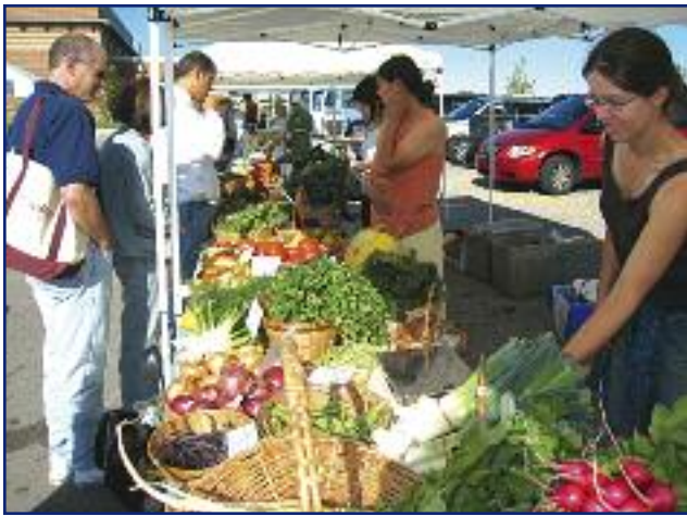
SWEETWATER LOCAL FOODS MARKET SELLS ONLY LOCAL AND ORGANICALLY GROWN PRODUCE

by people who recognize the need to change what and how they eat on an individual and systematic level.