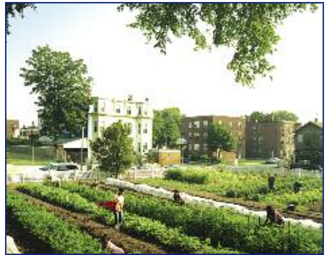
TFP CONVERT URBAN LAND INTO FARMS

Though The Food Project is primarily program-based, it is beginning to consider policy as a potential tool. Currently, the group is advocating for support of the Farm Bill, specifically to fund the USDA Community Food Projects. These grants support organizations like The Food Project and enabled it to launch its Leading in Food Systems Training, a program which provides training to groups working to change food systems.