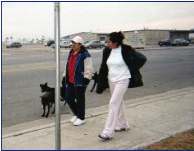
PARENTS AND COMMUNITY GROUPS OUT ON A WALKABILITY ASSESSMENT

to eat healthy and be active. The most frustrating barriers they faced were all of the obstacles they had to overcome as they just tried to walk and talk in their local park. Aggressive stray dogs harassed the group. The group had to avoid stepping on hypodermic needles. And as they walked they were frightened of being mowed down by unyielding motorists.