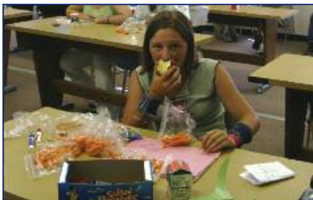
HUNGER ACTION PUSHED HEALTHIER SCHOOL FOODS ONTO THE PENNSYLVANIA GOVERNOR’S AGENDA

At the state level, Hunger Action asked Pennsylvania Governor Ed Rendell to highlight school breakfast in his annual budget proposal. Last February, the Governor responded with a plan to require school breakfasts in lower-income schools and to link increased state funding of school meals to school adoption of state