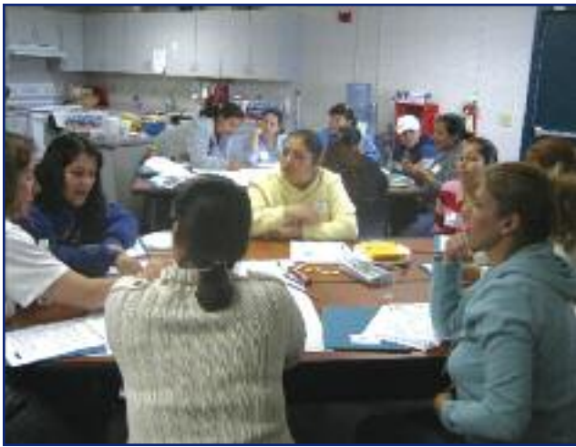
TOGETHER PARENTS OF THE GREENFIELD WALKING GROUP DISCUSS PRIORITIES FOR IMPROVING WALKABILITY

through its process to discuss the master plan for the San Joaquin Valley, as well as their county general plan for transportation and transit, they have held special sessions with the Greenfield Walking Group to get their input into the process. The group now provides technical assistance to residents and organizations throughout Kern County on how to transform their communities. California Walks shares the experience of the Greenfield Walking Group as the advocacy group conducts walkability assessments throughout the state.