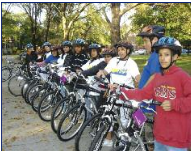
CBF WORKS ON POLICY IN ADDITION TO BIKE SAFETY EDUCATION

Among CBF's statewide policy successes in 2007 was a piece of Complete Streets legislation, requiring that the state include bike and pedestrian pathways in the planning and construction of state roads. In partnership with The League of Illinois Bicyclists, CBF also pushed successfully for state law that will require