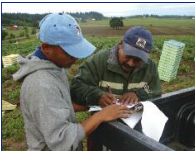
LAST YEAR, PCUN SOLD 6 TONS OF ORGANIC PRODUCE TO MOM AND POP SHOPS IN LATINO COMMUNITIES