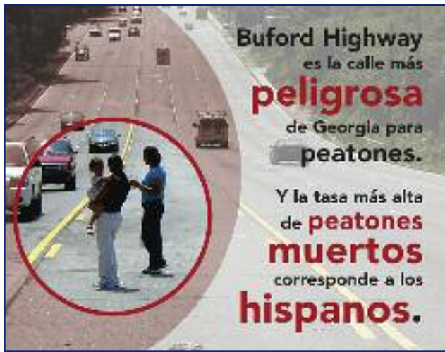
BRINGING ATTENTION TO PEDESTRIAN HAZARDS ACROSS CULTURAL LINES

Since being named one of the ten most dangerous cities for pedestrians in the US by Mean Streets 2004 (issued by The Surface Transportation Policy Project), Atlanta has experienced a number of positive shifts to make their streets safer. PEDS has been at the forefront of those changes. At the helm, PEDS has advanced a statewide policy to get cameras installed at signal lights to help enforce red-light violations. The organization moved forward a policy to install in-street crosswalk signs throughout Atlanta that will alert drivers to the presence of pedestrians.