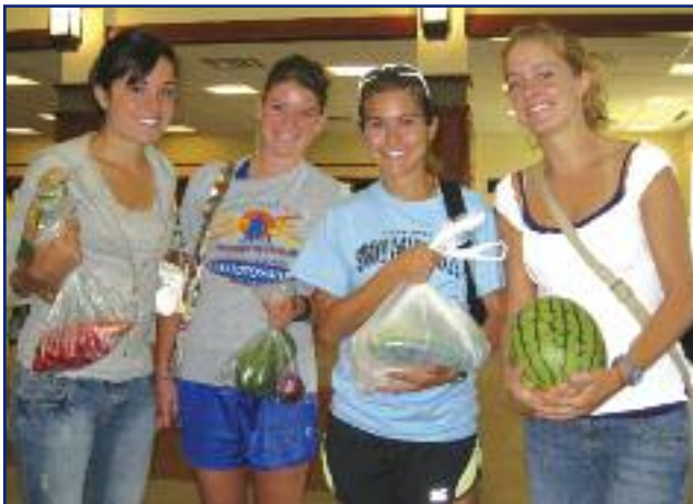
CES IS PUSHING A 2010 INITIATIVE THAT WILL CLASSIFY HEALTHY LOCAL FOODS AS PREVENTATIVE MEDICINE