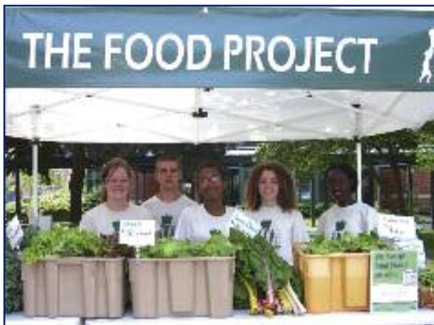
PRODUCE IS GROWN AND SOLD BY YOUTH

The core of the organization's work is the Summer Youth Program. One hundred high school students are employed to work on a 31-acre farm in Lincoln and 2.5 acres of food lots in inner-city Boston. Up to 20 of those youth can choose to continue their work during the Academic Year Program leading Saturday