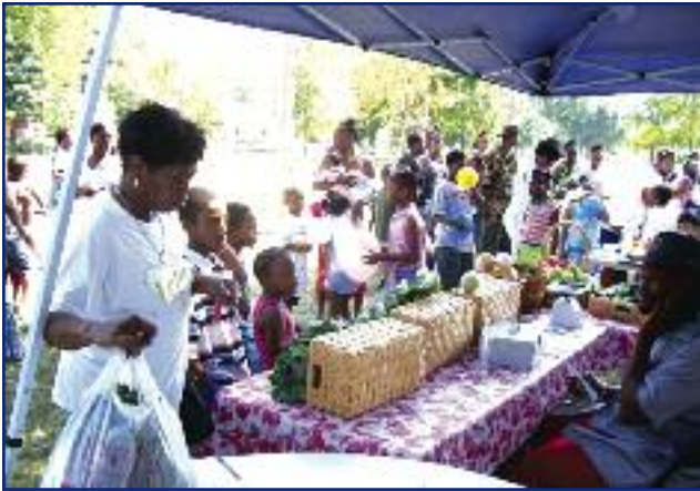
COMMUNITY FARMERS MARKETS PROVIDE FRESH PRODUCE FOR URBAN COMMUNITIES

amassed a track-record of state and local-level successes. As CFA looks ahead to developing a food policy council, building support for the municipal “buy local” ordinance, and creating incentives for corner stores, effective collaboration and capacity-building will remain the pillars of their advocacy efforts.