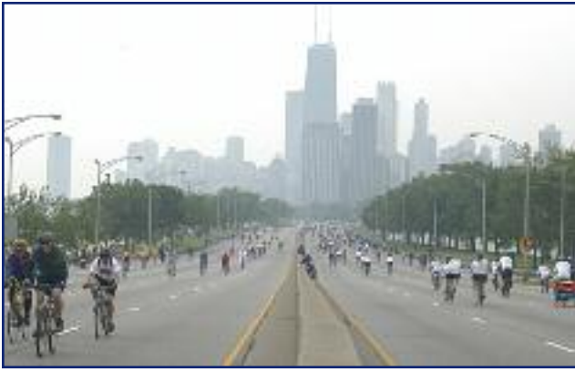
BIKE EVENTS RAISE MONEY AND AWARENESS ABOUT ALTERNATIVE TRANSPORTATION AND BIKE SAFETY

organizational coalition building and community-based outreach and engagement. In addition to policy advocacy, the 5,700 member organization also hosts public events and runs programs such as Go Healthy!, which encourages people in low-income communities to incorporate walking and bicycling into their daily lives. Participants are asked to complete 3-day travel diaries, indicating all of their trips and Go Healthy! Coaches help them figure out which trips they can most easily substitute with a walk or bicycle ride. CBF pays two community liaisons to engage Chicago resi-