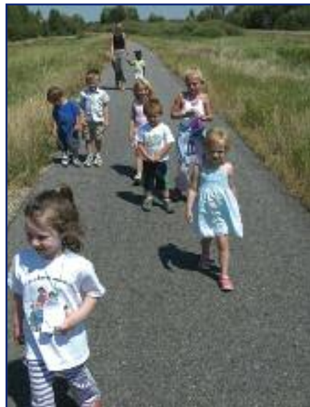
INTRODUCING TRAILS TO THE NEXT GENERATION