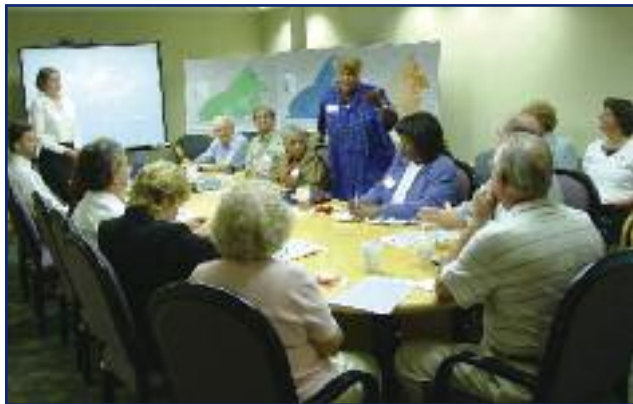
SENIORS SHARE THEIR OPINIONS WITH POLICY MAKERS

Atlanta is experiencing an unprecedented boom in its elder population. Today there are 400,000 seniors in the Atlanta metropolitan area, and by 2030 the number of people in the area over 60 years old is expected to