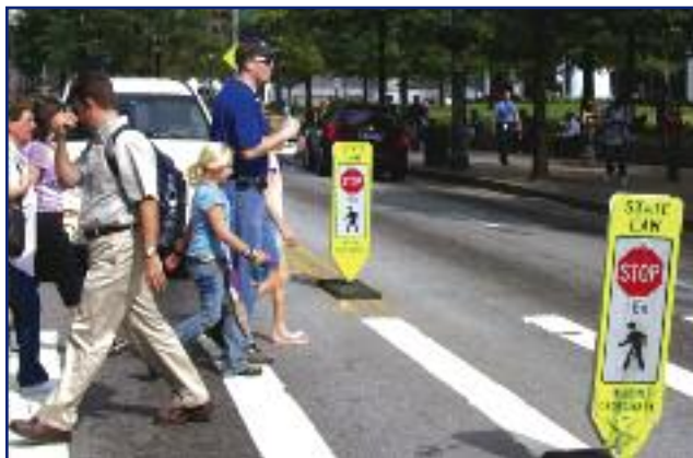
HIGH-VISIBILITY CROSSWALK MARKERS HELP KEEP PEDESTRIANS SAFE

For the last 10 years, PEDS has emphasized pedestrian safety for immigrants and in-town communities because these populations are disproportionately