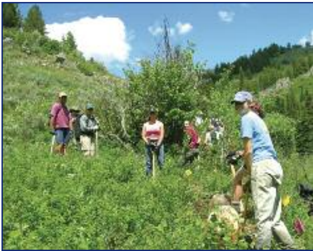
VOLUNTEER CREWS CREATE A TRAIL

members consistently attend City Council meetings when new land use ordinances are being discussed. TVTAP also has an active Board that helps to facilitate community dialogue and action.