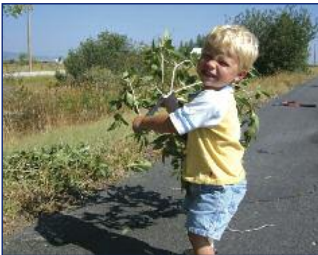
CLEAN TRAILS ENCOURAGE USE

Teton Valley Trails and Pathways (TVTAP) represents 500 active, dues-paying residents working to shape the valley so that it will continue to support physical activity opportunities. TVTAP members are concerned that without policy controls, new development efforts could encroach on natural resources and wipe out op-