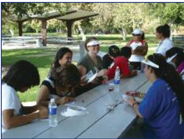
COMMUNITY RESIDENTS PREPARE TO CONDUCT A WALKABILITY ASSESSMENT

When Get Moving Kern , a coalition of organizations focused on healthy eating and active living, were chosen as the community partner for The California Endowment's Central California Regional Obesity Prevention Program (CCROPP) in October 2006, they were required to set up a task force to work with the local health department that would include residents. "I didn't just want to set up a task force of organizations and then ask a few residents to come be a part of our group after an agenda had already been set. I really wanted to start with a coalition of residents. So, I