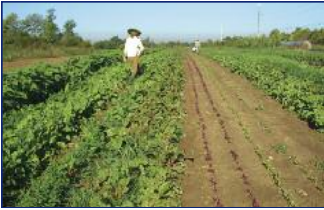
CFA HELPS KENTUCKY FARMERS FIND AND DEVELOP NEW MARKETS

boards, a state-level Agriculture Development Board, and a set of accountability measures to support family farming and diversified farming practices ( e.g. , multiple crops, growing organic). CFA's goal is to ensure that family farmers are engaged in a democratic process to determine how land will be used and how the $1.7 billion awarded to Kentucky will be spent over the next 25 years. CFA will continue to serve as a watchdog for policy implementation and resource allocation.