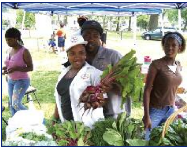
FARMERS MARKETS PROVIDE LOCAL MARKETS FOR FARMERS

Created in response to the farm crisis more than 20 years ago, CFA maintains its roots in policy advocacy