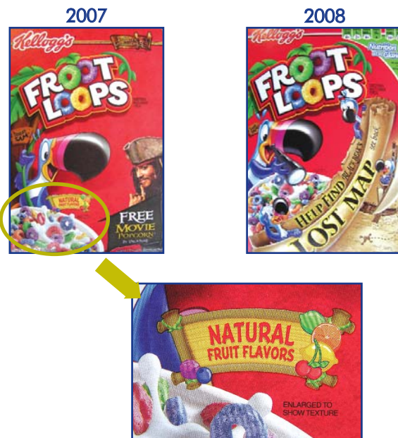
FIGURE 2. FROOT LOOPS