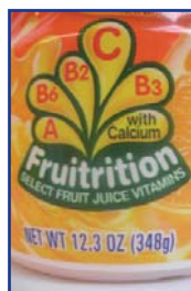
Tang’s new “Fruitrition” logo