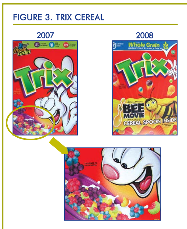
FIGURE 3. TRIX CEREAL

representations of fruit from the packaging (see Figure 2). The packaging now contains no references to fruit. There was no change in the ingredient list.